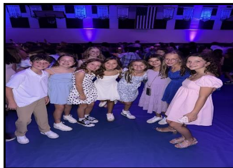
6 th graders pose for a quick picture at the MMS Decades Dance