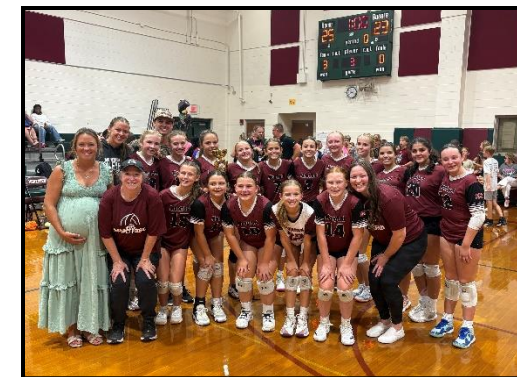
Volleyball team after winning the district championship for 6 th year in a row!

imagine what my time at Montford would be without it." The championship game was held at Montford, and it was a packed house with the cheerleading squad & members of the band in attendance, making it a great experience for the players and fans. Being a part of a team and or a club at Montford is such a great way to meet new people and be a part of something. The volleyball team is a great example, as such a tight-knit group of amazing girls! Congratulations, 2025 Champs!