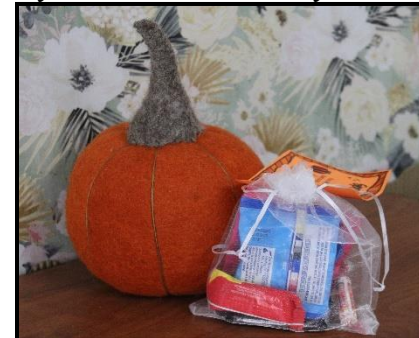
Spooky Gram full of sweet treats

Montford Middle School Distinctive Daughters club held their annual fundraiser throughout spirit week, selling “Spooky Grams” for $2 each. The girls were hoping to raise around $200. The variation of goodies in the bags they sold ranged from lollipops and chocolate to hard candies, etc. The money that the club raises is